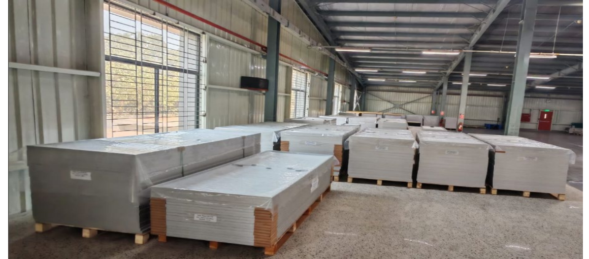
Finished Goods Area