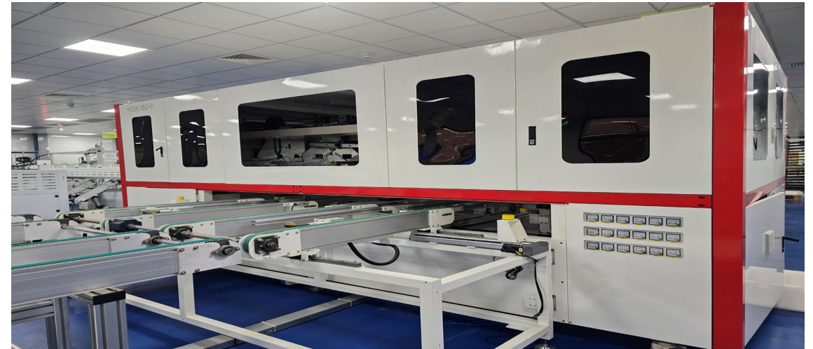
Auto Bussing Machine