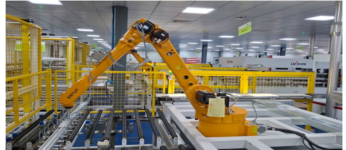
Automatic robot machine