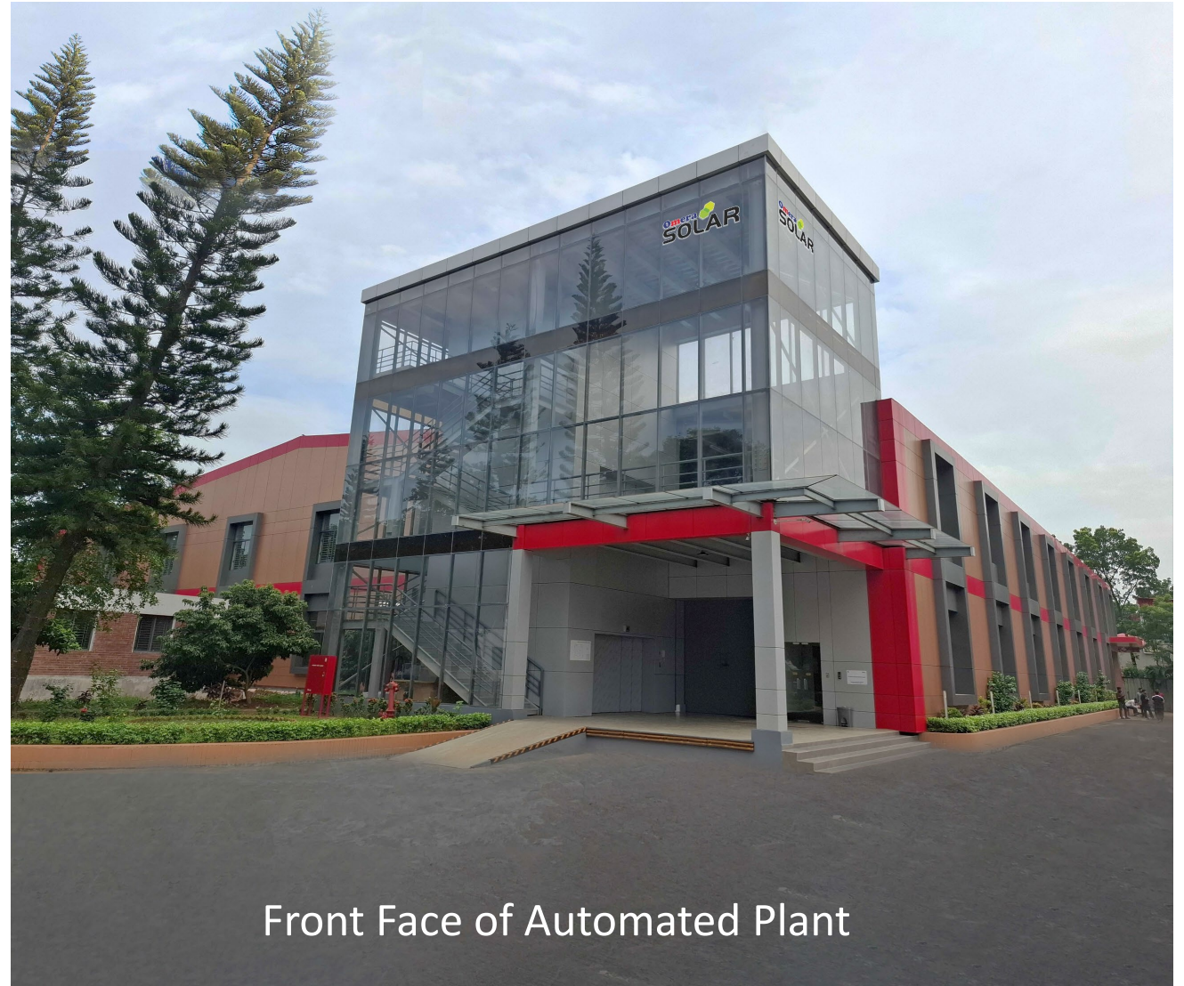
Front Face of Automated Plant