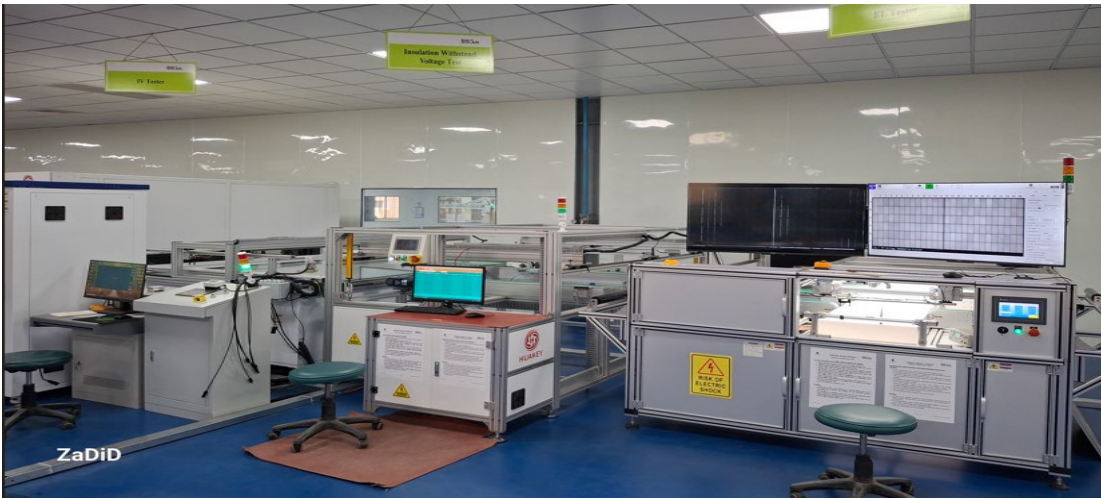
PV Module In-Line Testing Machine